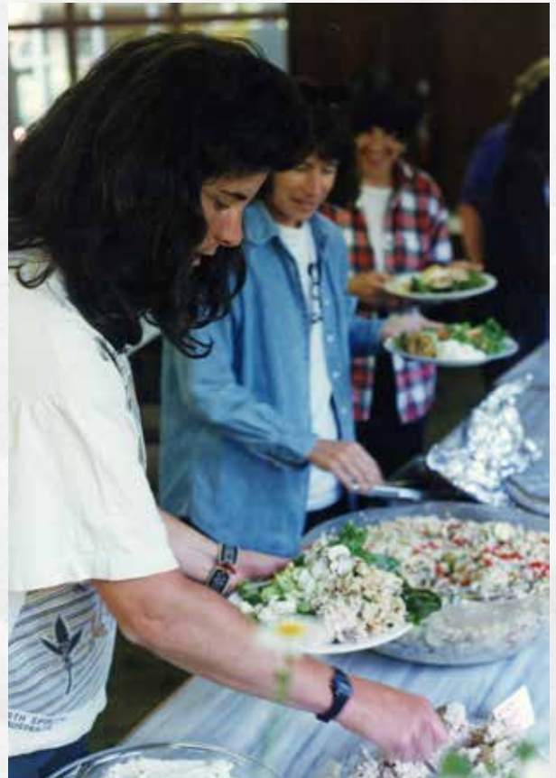
Lunch buffet, year unknown