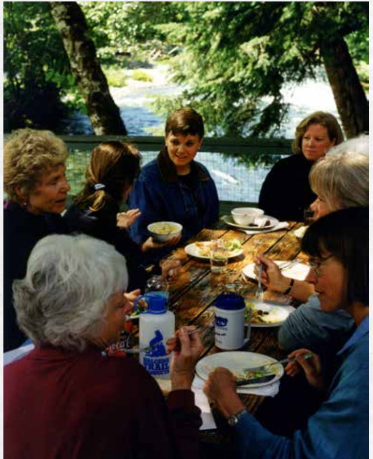
Participants enjoying lunch on the terrace, year unknown.

toss with tofu, drain and save what's leftover for noodle salad dressing